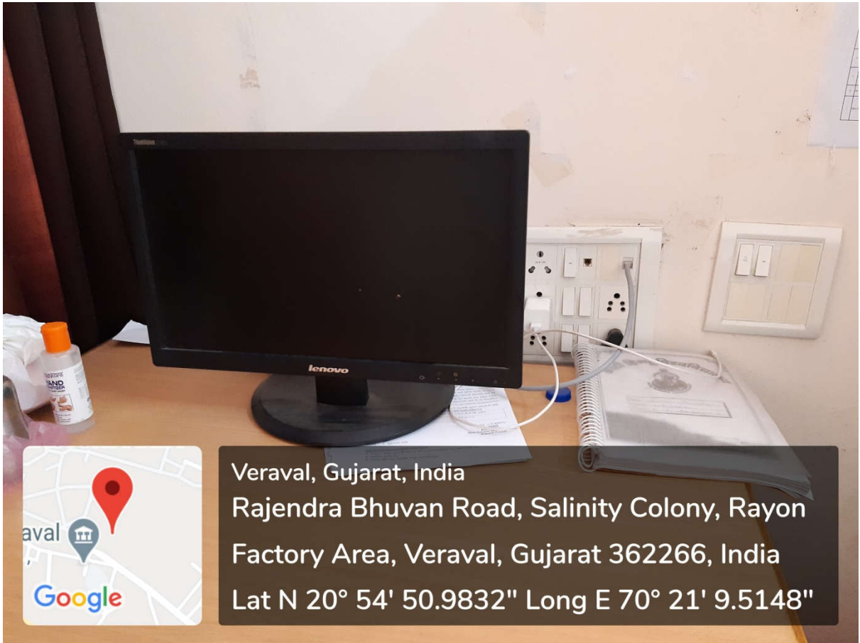
Room No. 12 – Computer with internet connection