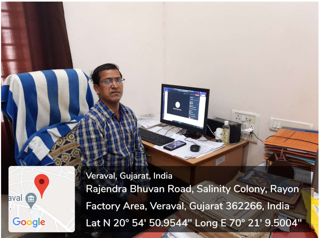
Room No. 08 – Computer with internet connection

Veraval, Gujarat, India Rajendra Bhuvan Road, Salinity Colony, Rayon Factory Area, Veraval, Gujarat 362266, India Lat N 20° 54' 50.9544" Long E 70° 21' 9.5004"