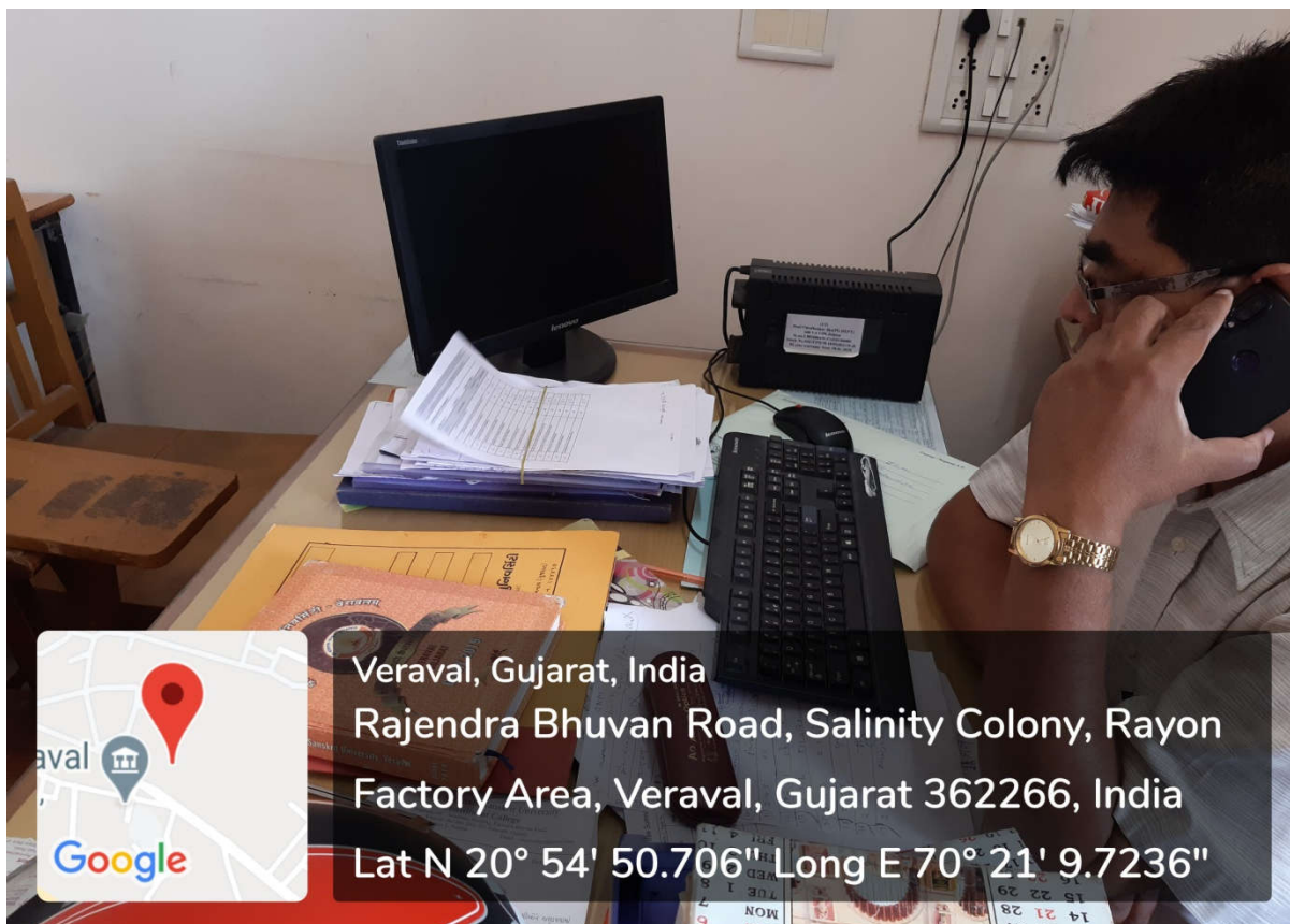
Room No. 06 – Computer with internet connection