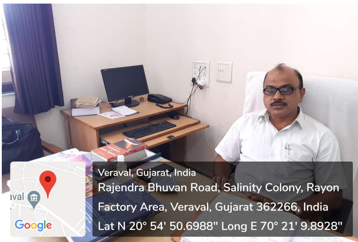
Room No. 07 – Computer with internet connection