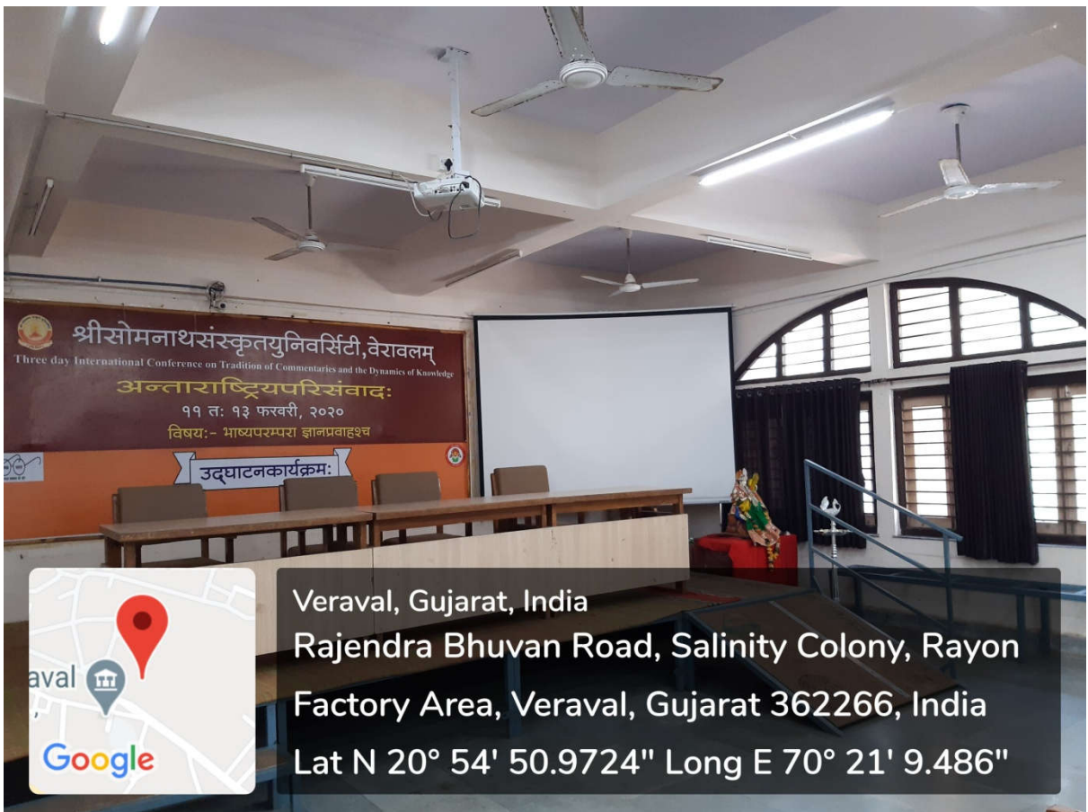
Room No. 16 - Front view with overhead Projector facility