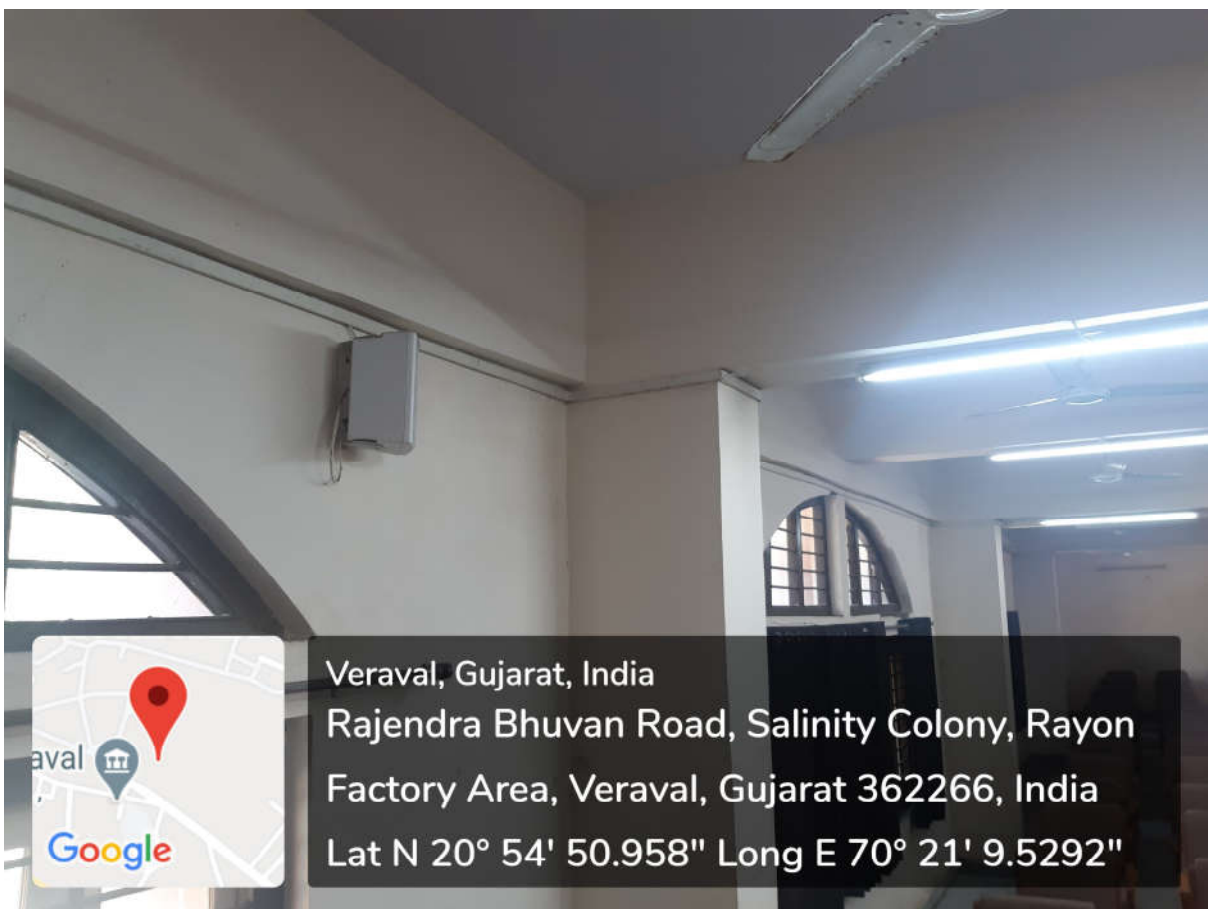
Room No. 16 - Speakers