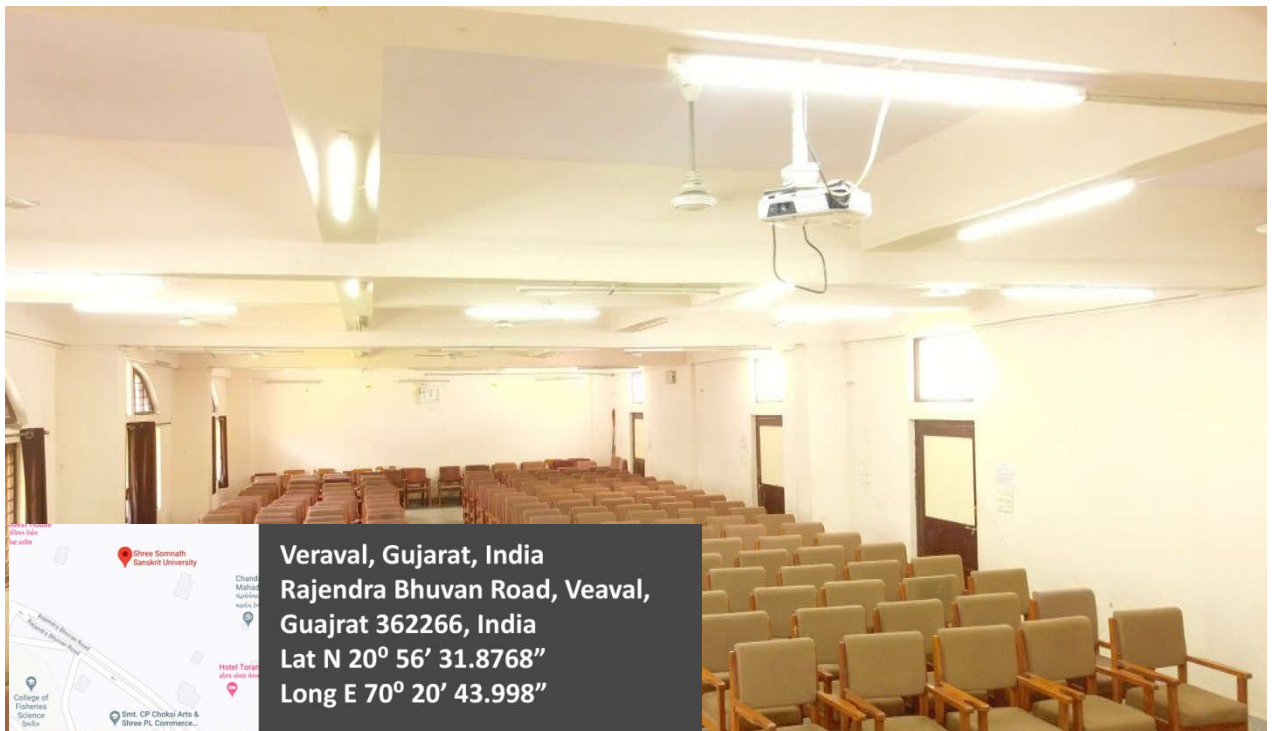
Room No. 16 with overhead Projector facility