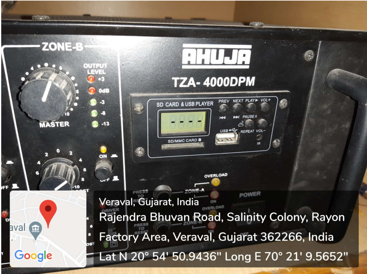
Room No. 16 – Audio amplifier for sound recording

Veraval, Gujarat, India Rajendra Bhuvan Road, Salinity Colony, Rayon Factory Area, Veraval, Gujarat 362266, India Lat N 20° 54' 50.9436" Long E 70° 21' 9.5364"