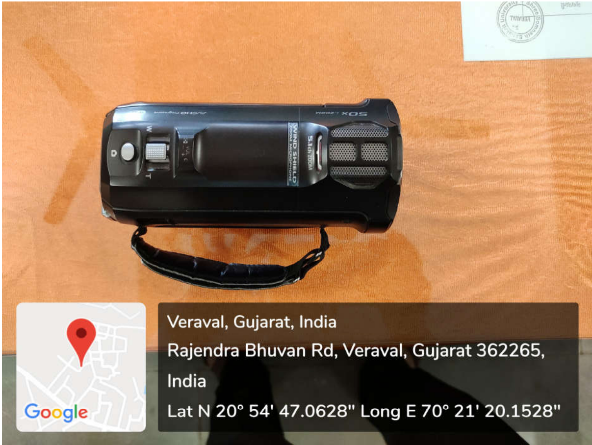
Separate Video Camera for Audio-Video Recording Room